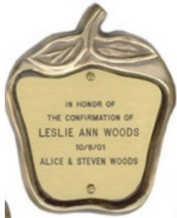
brass and bronze apple